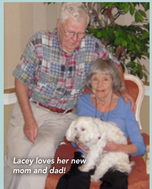
Lacey loves her new mom and dad!

Up she popped; a beautiful Maltese poodle mix with a face that defies description and old as we are (dog years). Hard of hearing, she talks with her ear motions. Smart as a whip, she exudes love and does her best to adapt to a new home and life style. She has made getting up in the morning worthwhile again (and a necessity). 🐾